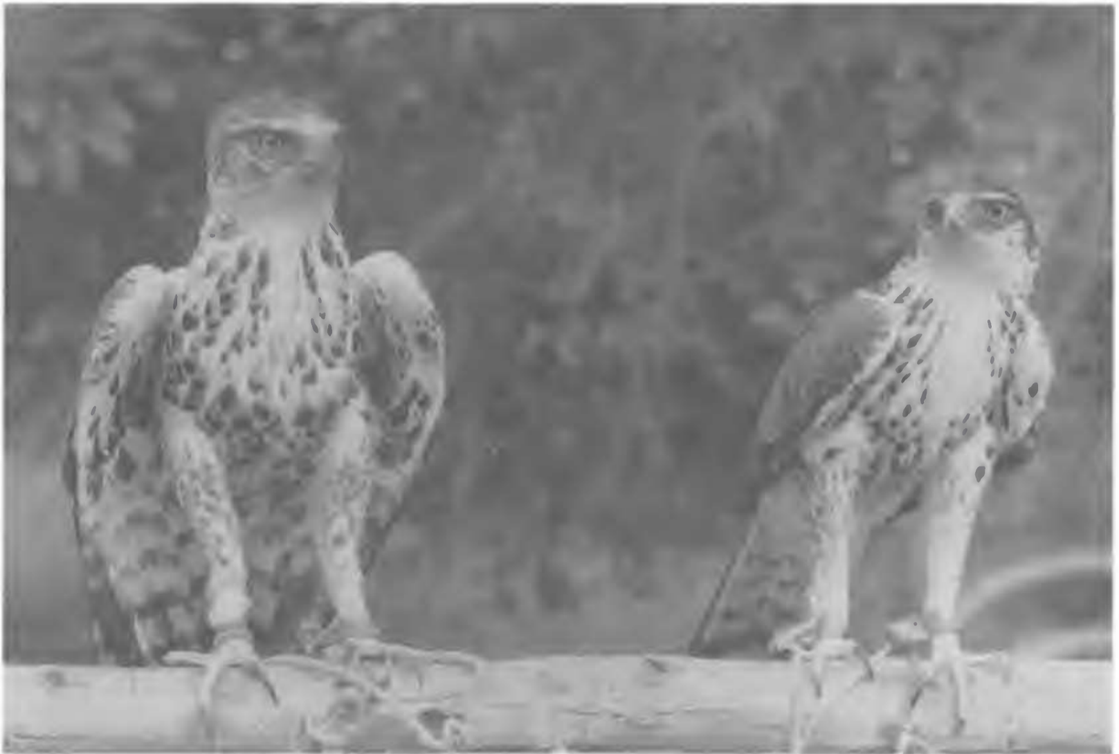
Figure 2. Nine-yr old female Ayres's Hawk-Eagle (left) and 5-yr old male (right).

pale edged, and this 'scaled' appearance (see Brown and Davey 1978) can help to distinguish Ayres's Hawk-Eagle from the superficially similar African Hawk-Eagle. Six adult females were dark morphs (Table 3), four of these from Zambia. Two of three adult specimens from South Africa were dark morphs (A. Kemp pers. comm.).